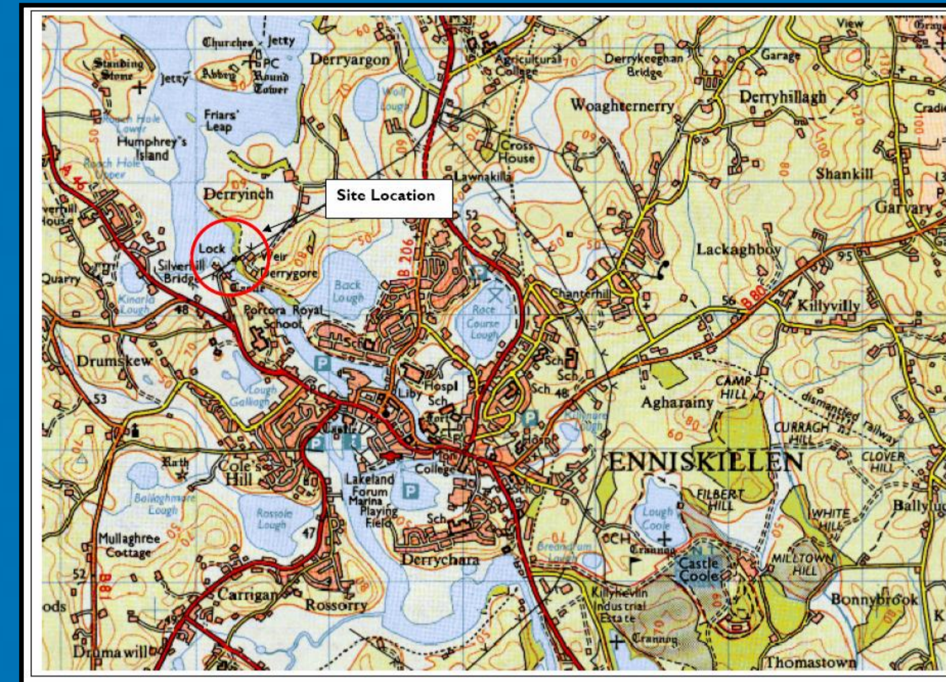
LOCATION PLAN 1

Any representations should be sent to:- Owen McGivern Department of Agriculture and Rural Development Rivers Agency Hydebank 4 Hospital Road BELFAST BT8 8JP