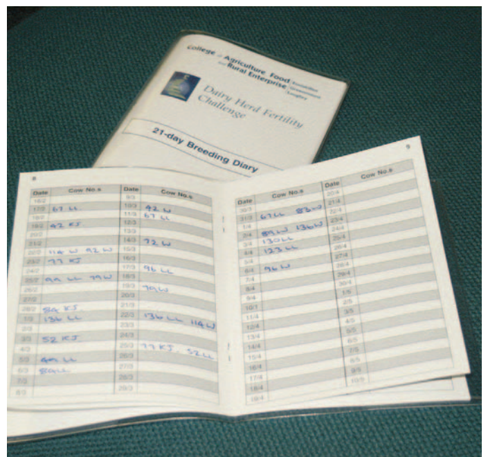
Figure 2: 21-day breeding diary.

A 21-day breeding diary allowing identification of cows in heat three weeks previous has been developed for the Dairy Herd Fertility Challenge for the identification of cows potentially due on heat based on previous heats and services (Figure 2). When used in conjunction with the herd recording sheets, this makes a very effective herd recording system for the generation of action lists and monitoring of herd fertility performance.