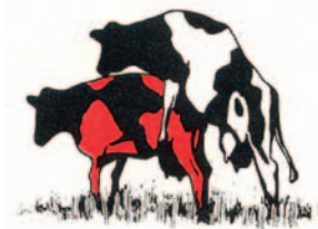
Figure 1: The primary sign of heat – cow standing to be mounted.